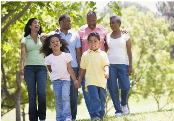
Couple with Children