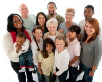
Blended Family or Domestic Partners