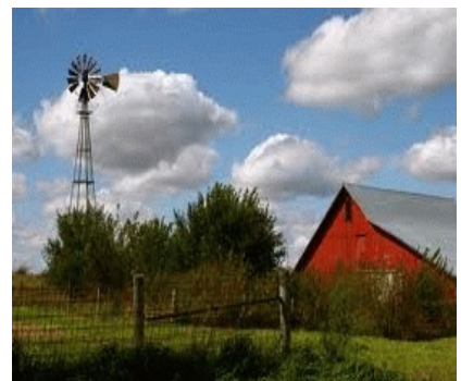
Family Farm or Business