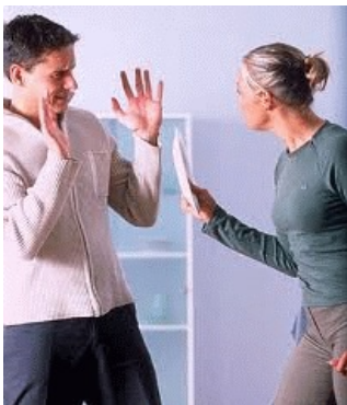
May Get a Divorce