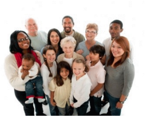
Blended Families or Domestic Partners