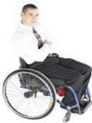
Special Needs Person